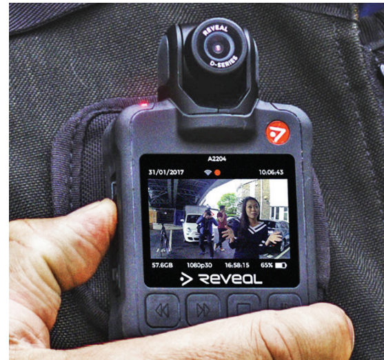
Reveal Media's Body-Worn Camera

contract (e.g., hardware durability and replacement, video management software maintenance, updates and technical support, data disaster, recovery, long-term data retrieval, etc.)